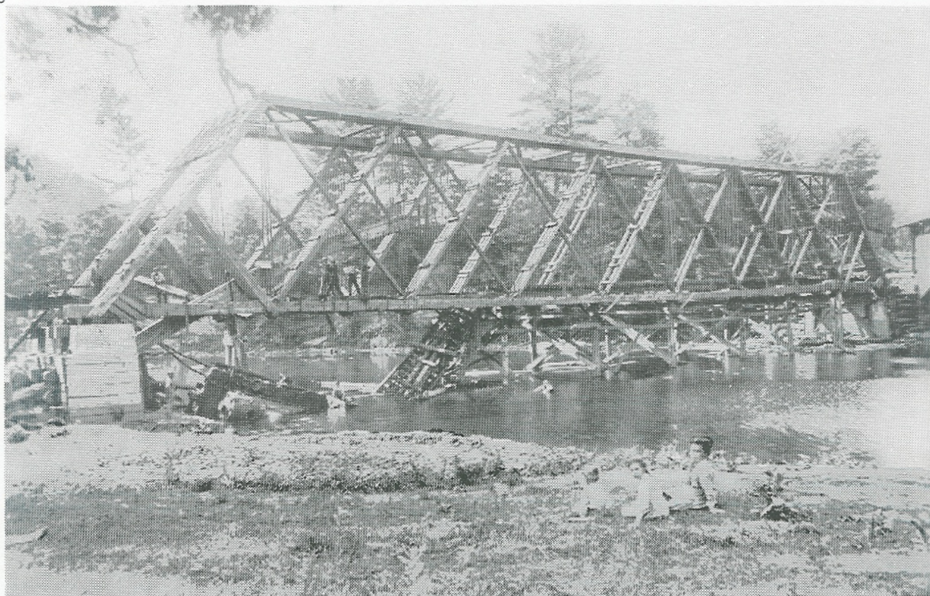
The wooden covered bridge, previous page, in the process of being razed after the locomotive fell through the left hand side of the bridge.